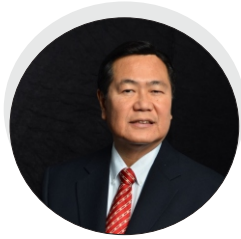
JUSTICE ANTONIO T. CARPIO